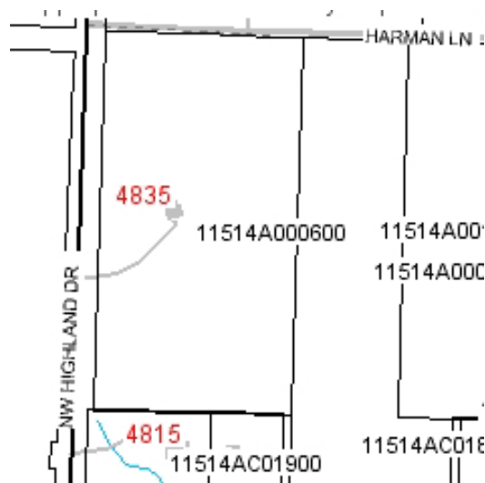
Map of Noyes Property

Part of the property is a grassy wetland. This wetland attracts many types of birds and animals, going to the wetland for food. The woodland also attracts many different types of birds and animals. The happy chirping of little birds like Black Capped chickadees greet the viewer as they arrive. Small animals like rabbits and field mice can be heard, or seen, tromping around in the undergrowth. The site has a welcoming aura that is inviting to both animals and humans.