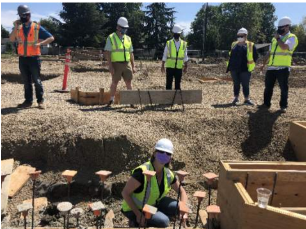
Board members inspecting the footings at Lincoln

The impacts of Covid-19 on the construction projects continue to be minor, but are being closely monitored.