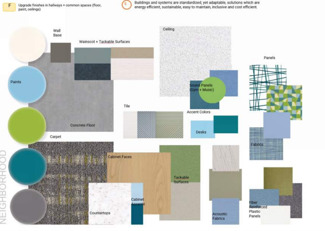
Updated Materials Board from June 26 Core Team Meeting – Jefferson ES