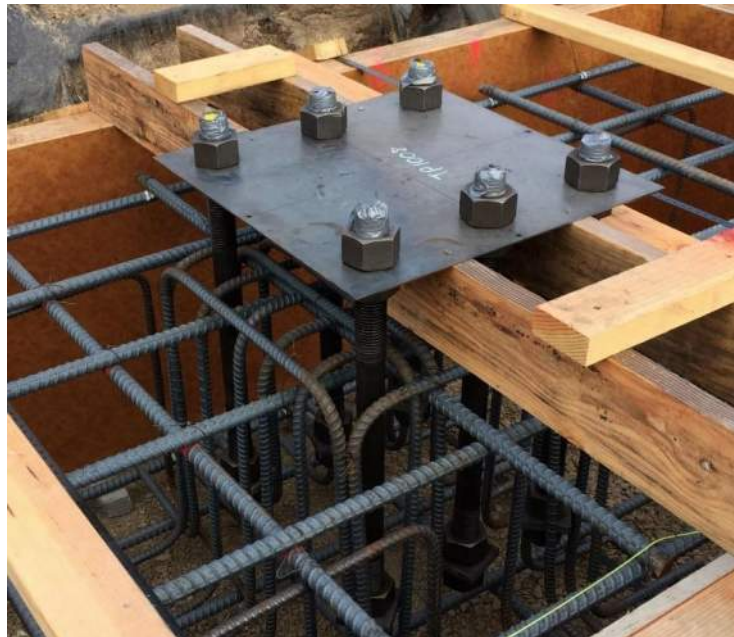
Typical footing showing reinforcing steel and column anchor bolts