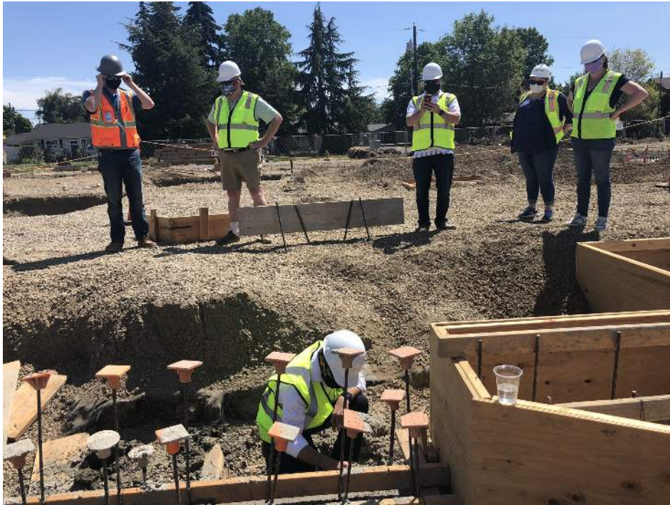
Board members inspecting the footings and carving their initials into wet concrete