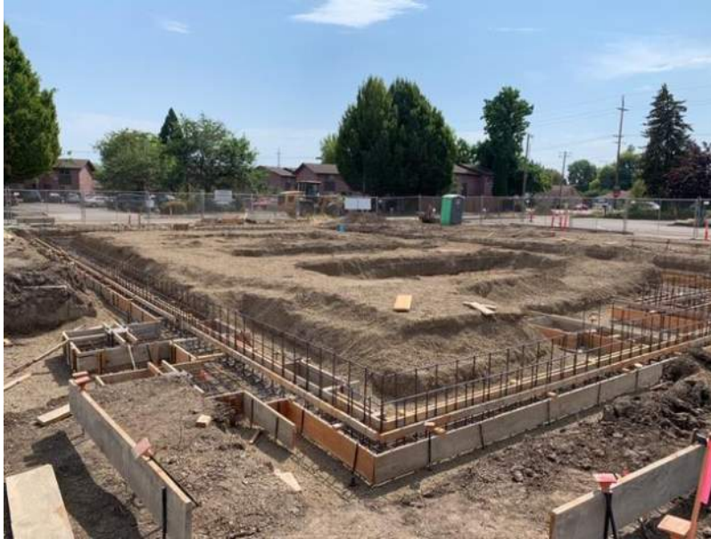
Foundations for the Benton County Health Clinic are underway