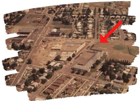
1951 Classroom Wing Addition