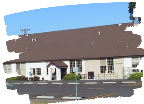
Main Office Entrance, west side of building