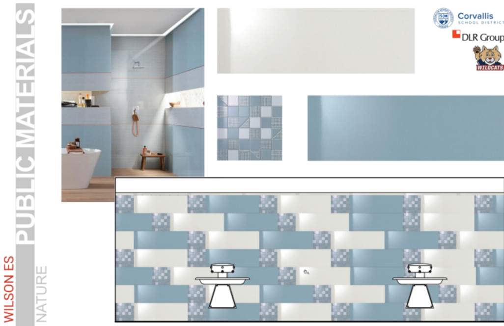
Preliminary Restroom Tile Design – Wilson ES